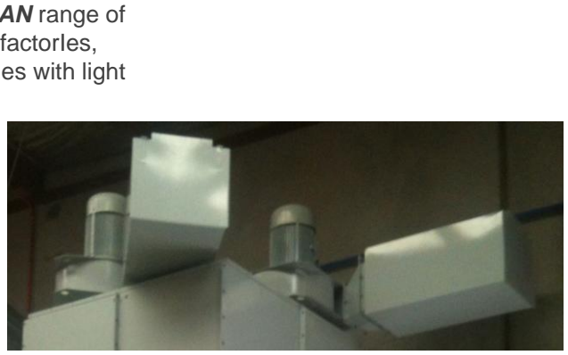
Multiple motors or Ground mount fan